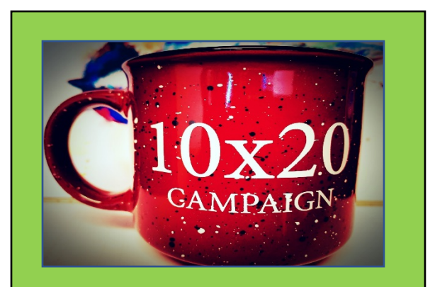
Our pro bono practice group is targeting 10,000 pro bono hours as part of our "10x20" campaign, meaning 10,000 pro bono hours by 2020.